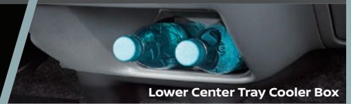
Lower Center Tray Cooler Box