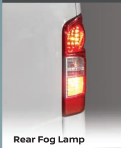
Rear Fog Lamp