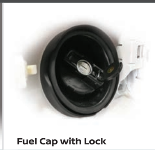
Fuel Cap with Lock