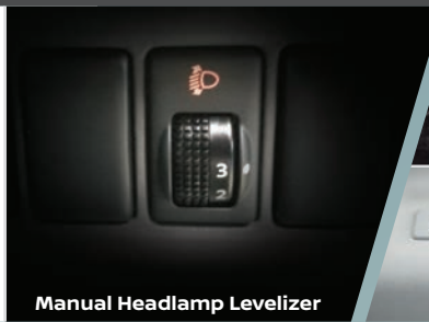
Manual Headlamp Levelizer