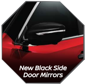
New Black Side Door Mirrors