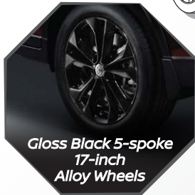
Gloss Black 5-spoke 17-inch Alloy Wheels