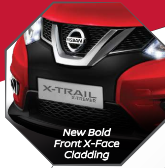
New Bold Front X-Face Cladding