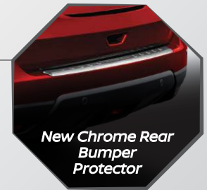
New Chrome Rear Bumper Protector

X-Trail X-Tremer available in limited units.