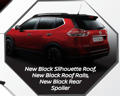
New Black Silhouette Roof, New Black Roof Rails, New Black Rear Spoiler